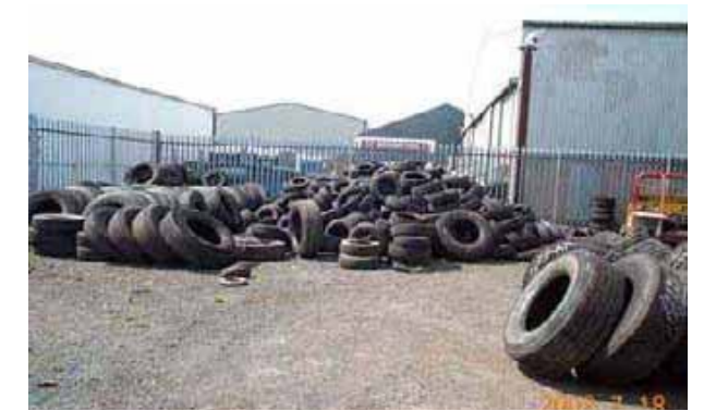
Figure 15. Bad practice. How not to store used tyre casings!