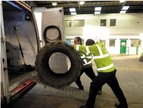
Figure 6. Loading an agricultural tyre.

At this site the wholesaler loads a fleet of small vehicles with a wide variety of new tyres from warehouse stock, for delivery to retailers on a set of routes. The routes are repeated each day, but the tyres transported vary considerably from day to day. The company have specified their own fleet of vehicles for the purpose. In particular, the vehicles have a low internal floor level (less than 500mm above ground level) which aids the loading and unloading process. The range of tyres transported varies from 1kg for pneumatic trolley tyres to over 100kg for tractor tyres.