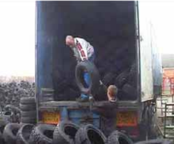
Figure 8. Loading tyres in factory yard.

Casings are handled from a laced, or unlaced stack within the vehicle to a cradle trolley or gondola. They are usually laced into the cradle trolley. It is common for two workers to perform this operation, one in the vehicle pulling casings down and passing them to the second worker at ground level outside.