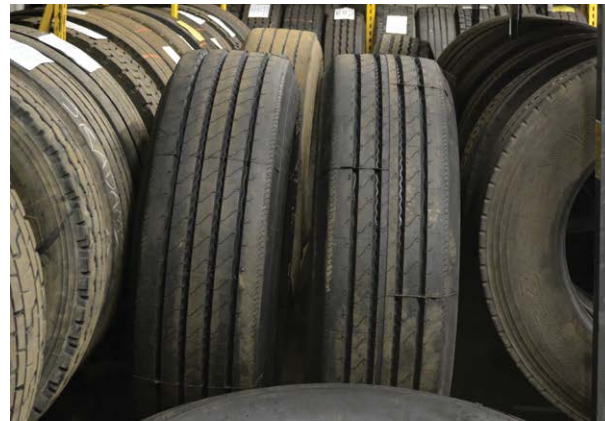
Figure 13. Good practice. Large tyres kept vertical makes collecting and rolling them easy.

Consider alternatives to lacing tyres wherever possible. Lacing is probably the single largest barrier to avoiding many manual-handling operations within industry. Although not yet widespread, it is becoming increasingly common for tyres to be handled in packages, either palletised or on stillages. For example, some car manufacturers request that their original equipment tyres are supplied on stillages (which are subsequently returned to the supplier). The new tyres are then transported to the point of use mechanically.