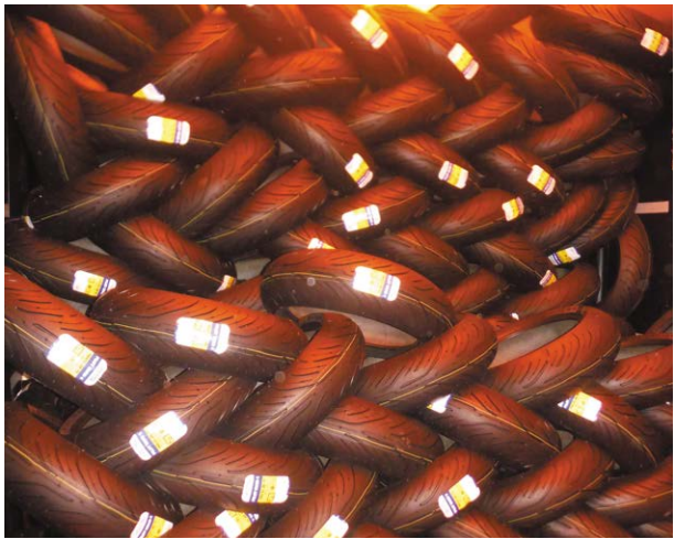
Figure 5. Lacing the casings inside the collection vehicle. A roof letting in daylight like this one makes the job easier.