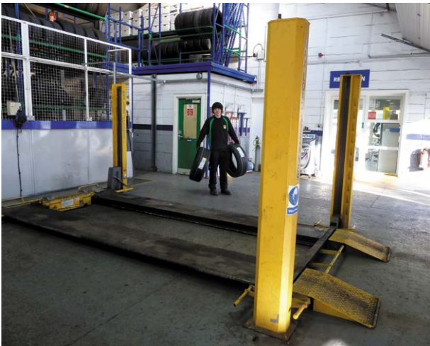
Figure 4. Sometimes tyres are carried through the fitting bay, in which case a carrying assessment should also be made.

Figure 3 shows a good example of casings being rolled between the stack and the vehicle, however, the casings often have to be carried through the tyre fitting bay or other operational parts of the premises, as shown in Figure 4. Distances of 10 metres are typical and tyres are rolled whenever possible rather than carried. The operation generally involves two retail staff and the collection driver. The driver works inside the vehicle, usually a rigid sided lorry, and laces the casings into it, (see Figure 5). One of the retail staff unlaces casings from their stack and rolls the casing to their colleague at the rear of the vehicle who lifts it in (to a height of approx 1250mm) and rolls it to the driver. Rolling the tyres avoids the strain of carrying them. The vehicle capacity is generally around 800 casings. The driver typically makes two collections the same day to pick up a full load.