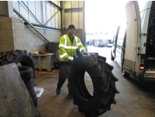
Figure 7. Some of the tyres can be very large.

Loading into delivery vans is manual and usually performed by one member of the warehouse staff working with the vehicle driver. If necessary, and especially for larger agricultural tyres, another worker assists. Large tyres are rolled into the van by two or three workers pushing together up a ramp made of wooden planks, (see Figure 6). Provided this goes smoothly, the operation is relatively easy. The pushing force required to roll the tyre up the ramp depends upon the weight of the tyre, the angle of the slope and where the force is applied. For a slope of 30 degrees, the overall force is estimated to be between approximately one half and one quarter of the tyre weight.