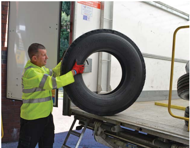
Figure 3 Transferring casings from the storage area to the collection vehicle

Usually there is somewhere set aside where the casings are stacked each day as required. This may be a place where the casings can be laced into a stack against or between walls, and which is reasonably accessible for when the casings need to be transferred to the collection vehicle.