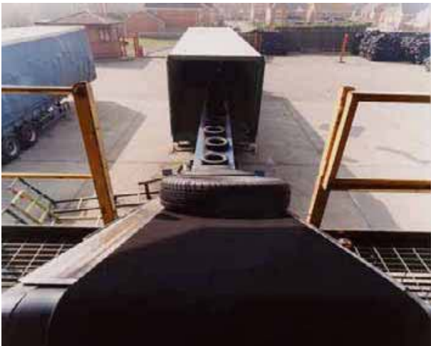
Figure 9. Conveyor feeding retreads into delivery vehicle.