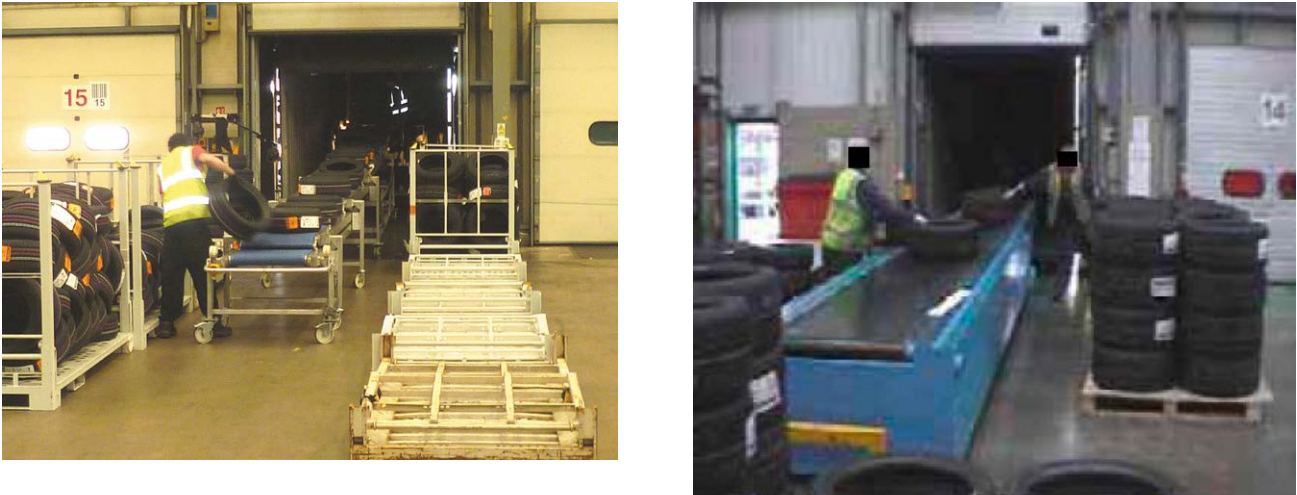
Figure 11. Loading/unloading a trailer using a powered conveyor.

The introduction of mechanical assistance in the form of a powered conveyor, (see Figure11), to the situation in case study 5a has changed the risks associated with the operation. The workers now perform the same function as before, except that an extending powered conveyor is now used to move the tyres in or out of the trailer, and the tyres are stored on pallets instead of in stillages.