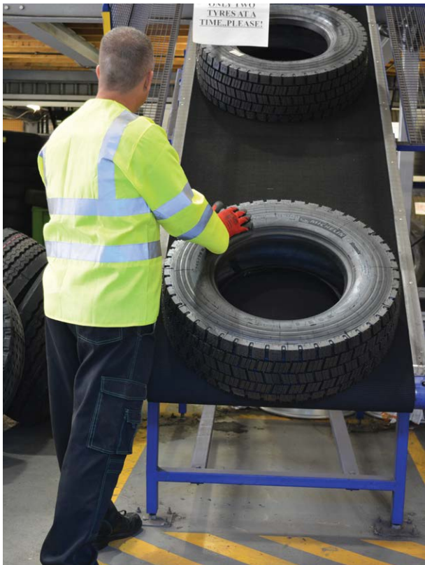
Figure 2. A conveyor used to transport tyres to and from a mezzanine floor store.

This operation is performed regularly, for example, once or twice weekly, and lasts for an hour or so, depending on the size of the retail premises and the rate at which they accumulate scrap casings. Collections of 150 to 400 tyres per week are normal.