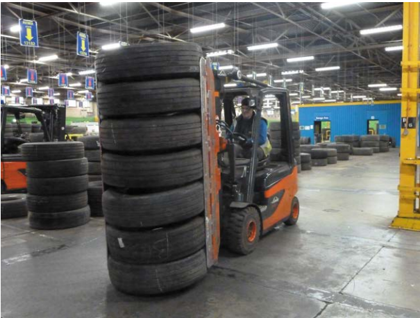
Figure 12. Fork truck fitted with tyre clamp.

If the loads can be stacked, and at this site some were stacked rather than laced, it allows for the possibility of handling batches of tyres mechanically. At a different loading bay this was being tried out with a fork truck fitted with a new clamp attachment, (see Figure 12). The truck was used to load and unload trailers with stacks of tyres. The rotating head of the clamp attachment enabled tyres to be lifted from and placed into stillages directly.