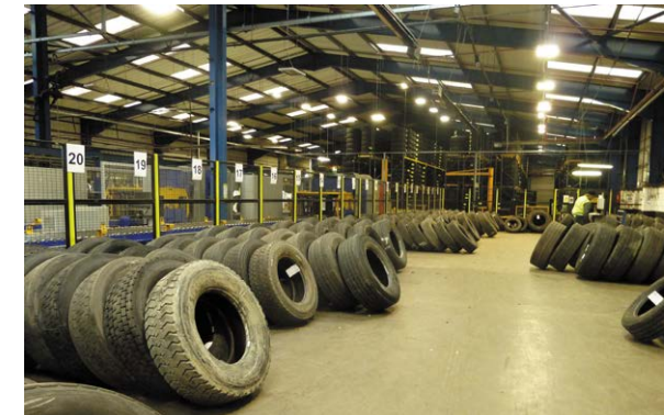
Figure 14. Bad practice[c2] . Large tyre casings stacked horizontally. They now have to be lifted off and turned to the vertical for rolling to the collection vehicle.