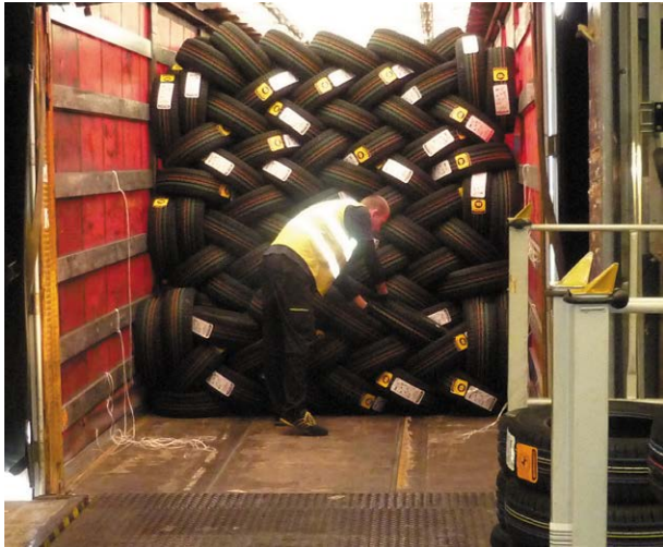
Figure 10. Loading/unloading a trailer at a distribution centre.

Figure 10 shows a good arrangement, identical for loading or unloading, where one worker is removing tyres from the stillage or placing them into it, and the other is either adding to, or removing tyres from a laced stack inside the trailer. The tyres are moved between the two workers by being bowled along the floor. The workers will generally develop a high level of skill in the bowling action so that tyres are directed accurately and with the minimum of effort.